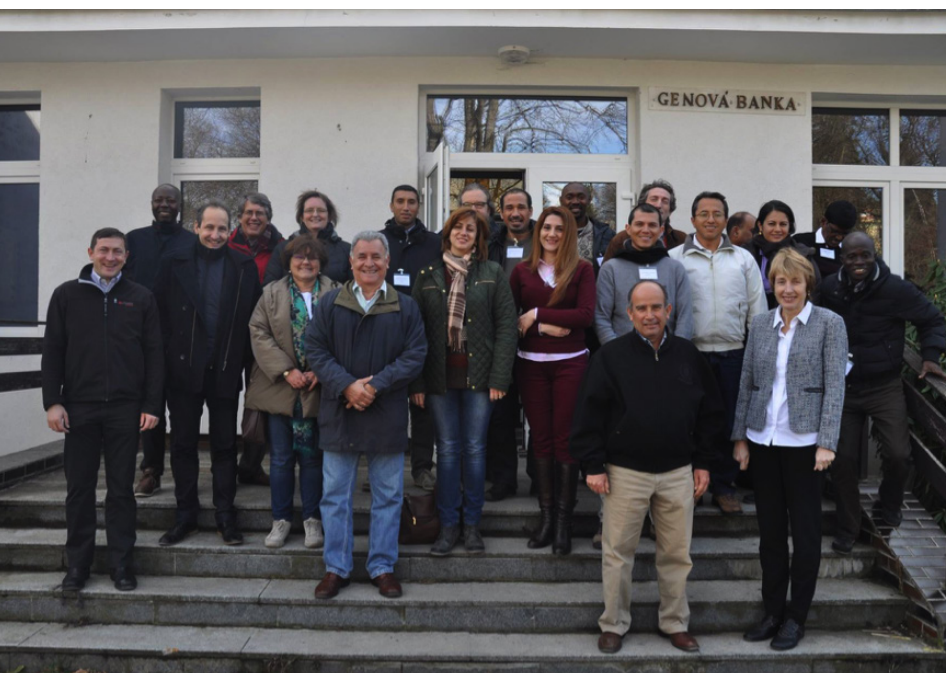
Participants in the GRIN-Global workshop, Czech Republic Genebank, February 2016.

The USDA GRIN-Global website contains links to the installation files and instructions for installing GRIN-Global.